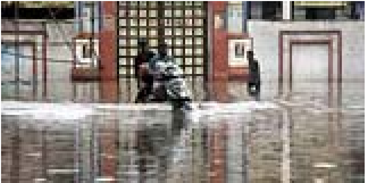
Real-time flood forecast becomes a reality in Tamil Nadu