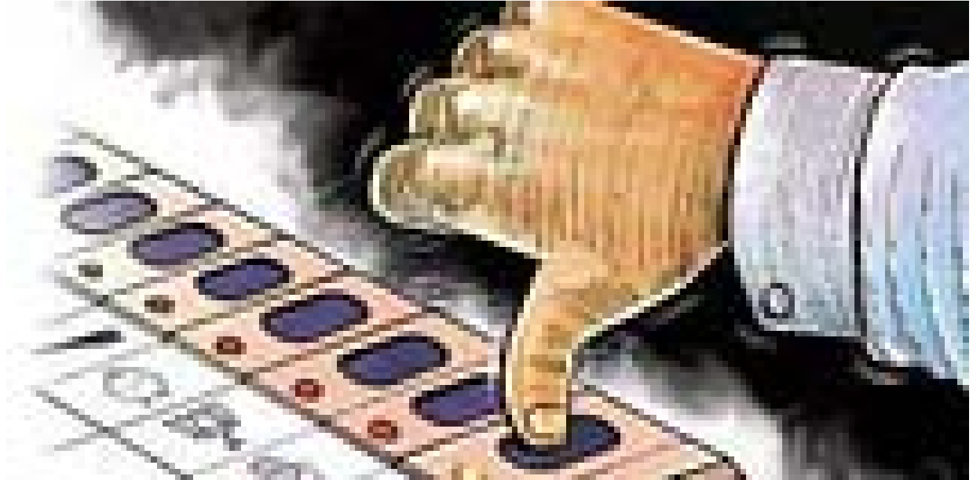
Gujarat elections 2022: Morbi, Porbandar, Anand... here are 25 seats to watch out for