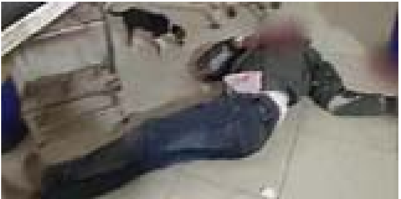
UP hospital video showing patient lying on floor with dog licking his blood goes viral