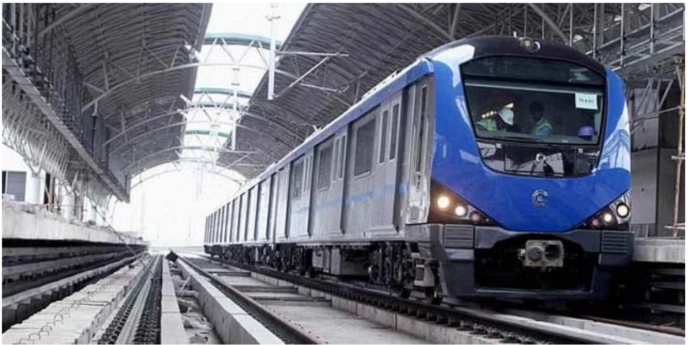
Chennai Metro