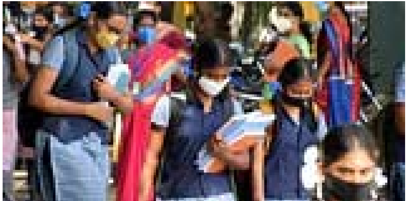
Kerala, Andhra top school performance index, Tamil Nadu slips: Report